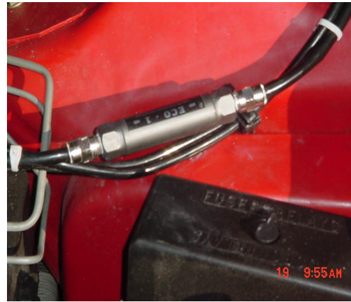
1996 Pontiac Firebird

1 to 4 Cylinder Gasoline/Diesel, Motorcycles & Outboard Engines.