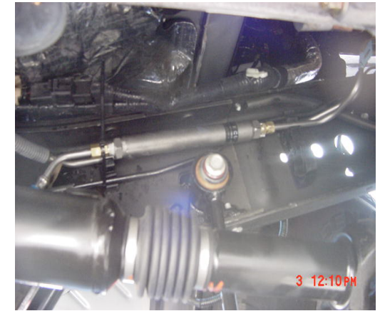
2003 Ford F-350 Power Stroke

Diesel Pick-Ups, 454 & 460 Gasoline Engines & Medium Sized Diesels.