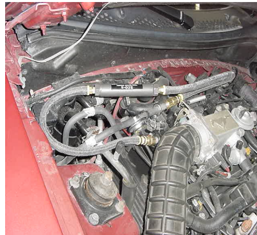
2001 Ford Mustang