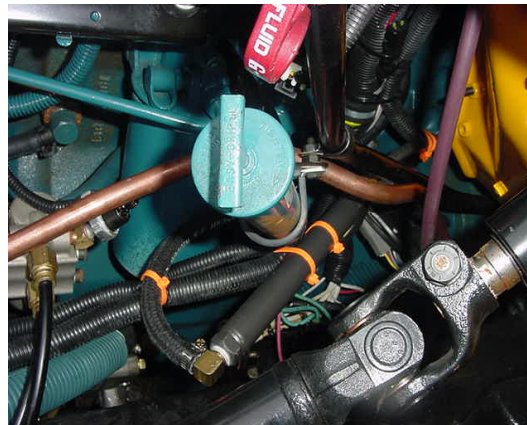
ECO-3 International Diesel

Typical installation on new International Diesel Engine