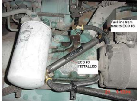
ECO #3 Installed into Fuel Line

ECO-Systems are preferred for school buses for the reduction of particulate exhaust (Black Smoke) and the increased performance. The hesitation at take-off is eliminated and a crisper throttle response is noted. Fuel savings and less maintenance cost are a major factor for a quick return on the investment.