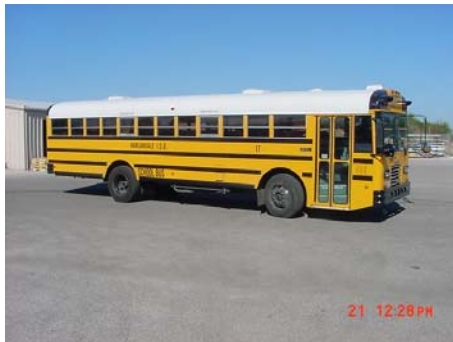
Harlandale I.S.D. with ECO-3